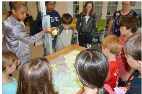
Figure 1. Candidates lead activities using an augmented reality topographical mapping device to teach about watersheds.

Leveraging VWU's diverse on- and off-campus education partnerships, pre-admission education-related courses (INST 202: The School and the Society, EDUC 266: Classroom Management and Teaching Strategies, and EDUC 225: Characteristics of the Learner) provide candidates early experiences in real-world teaching contexts to assist them in making the decision to continue or change their course of study. Figure 1 illustrates one of many projects meant to provide candidates the means to create a 21 st Century learning environment for future preK-12 students. These types of projects and early field-based experiences are enhanced through small class sizes and broad-based liberal arts coursework that encourage interdisciplinary thinking, critical thinking, and stronger relationships among students and between students and professors.