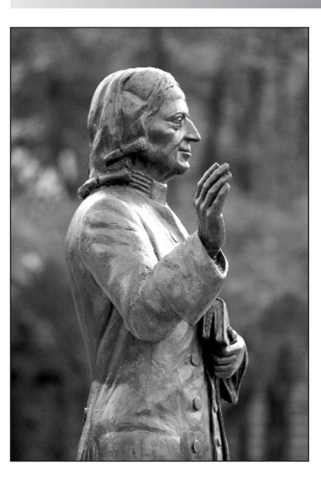
A first-rate faculty and personal attention are Virginia Wesleyan University trademarks that have earned the liberal arts institution a national reputation for excellence.